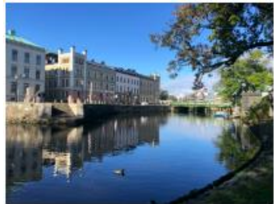
Scenic of Göteborg

In October, I had lectures as usual and there were a few assignments that I had to complete for the 2 courses I registered in the first period of the exchange. I visited Göteborg (around 3 hours of train from Lund C) in the first weekend for two days. It is the second-largest city in Sweden situated in Sweden's west coast. My friends and I visited the tourists spots there and again, we had fika in the afternoon. October in Sweden was already quite cold and the temperature of Göteborg in that two days dropped below 0 °C.